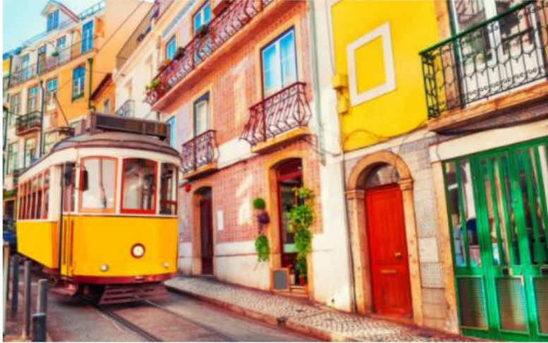
With Portugal on the green list, Britons can now holiday there without having to self-isolate on return